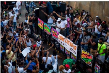
Go go group 'LIVE' runs on the crowd from a go go track at a June 6 rally making its way to the White House.